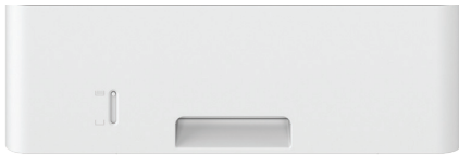
OPTIONAL CASSETTE-AHI Item: 0732A033