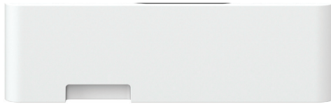
OPTIONAL CASSETTE AF-1 Item: 0732A032