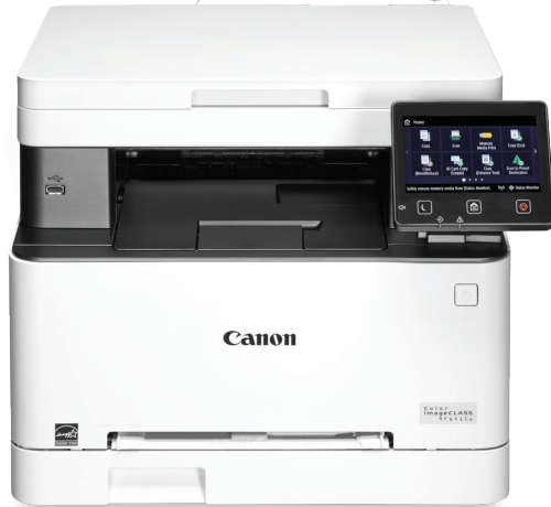
imageCLASS MF641Cw Item Code: 3102C019