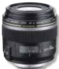
EF-S 60mm 0284B002