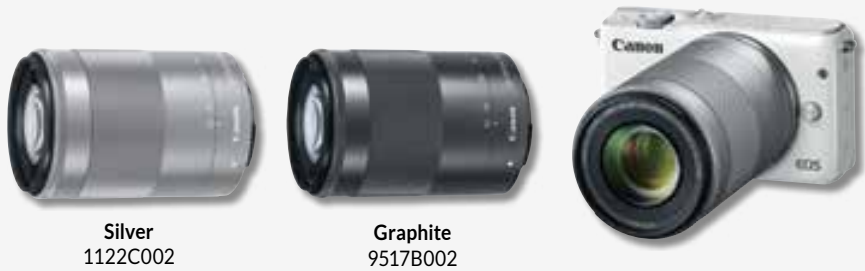
EF-M 55-200mm f/4.5-6.3 IS STM

Lightweight and compact design, Telephoto zoom lens, Optical Image Stabilizer, 5-group optical zoom system, Built-in stepping motor (STM), 7-Blade circular aperture