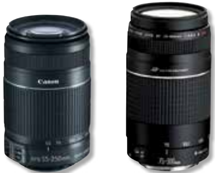
EF-S 55-250mm 8546B002

ULTRASONIC MOTOR (USM) to power the lens autofocus mechanism instead of large noisy drive trains powered by conventional motors, Canon USM lenses employ the minute electronic vibrations created by piezoelectric ceramic elements. The focusing action of the lens is fast and quiet, with virtually instantaneous stops and starts.