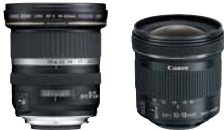
EF-S 10-22mm 9518A002