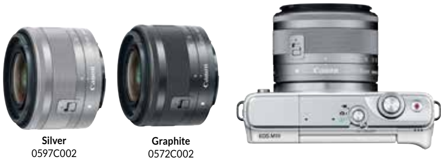
EF-M 15-45mm f/3.5-6.3 IS STM

Compact and stylish standard zoom lens, Optical Image Stabilizer, Built-in stepping motor (STM), Full-time manual focus mode