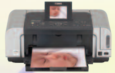
PIXMA Photo Printer