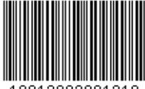
MASTER CARTON BAR CODE