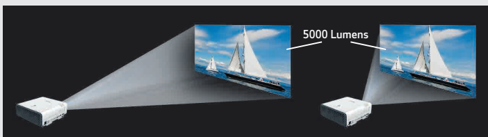
The WUX500 / WUX500 D offers the full projector light output regardless of the zoom position.