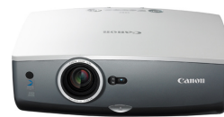
REALiS SX80 MULTIMEDIA PROJECTOR

Offer available October 1 - December 31, 2009