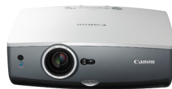
REALiS SX800 MULTIMEDIA PROJECTOR