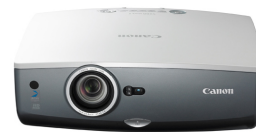
REALiS SX80 Mark II MULTIMEDIA PROJECTOR