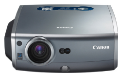
REALiS WUX10 Mark II MULTIMEDIA PROJECTOR

Purchase any of these models and receive a FREE replacement lamp by mail - a $579 retail value!