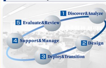
Canon MDS Cycle and Phases

Canon MDS evaluates customer's needs and ensures continuous business improvements through a five phase approach, as depicted in the below graphic.