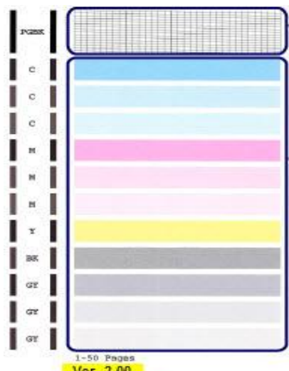
Firmware Version is Printed

5. Examine the nozzle check pattern (printout) for firmware version.