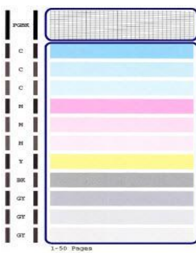
Firmware Version is Not Printed