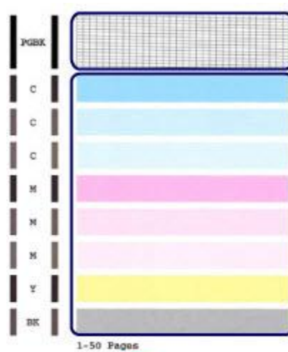
Firmware Version is Not Printed